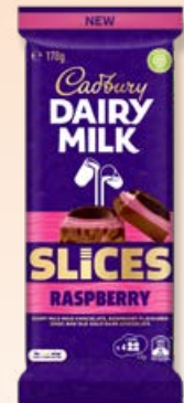
#4269098 Cadbury Slices Raspberry Block 178g Qty: 16 SKU: 9300617304555