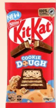
#427078 Kit Kat Cookie Dough 170g Qty: 13 SKU: 9300605152830