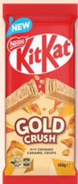
#4268710 Kit Kat Gold Crush 160g Qty: 12 SKU: 9300605155435