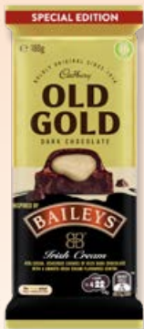
#4269090 Cadbury Old Gold Baileys Block 180g Qty: 15 SKU: 9300617306245