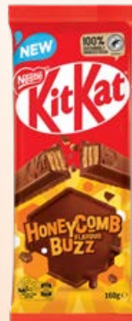
#4268716 Kit Kat Honeycomb Buzz Qty: 12 SKU: 9300605155428