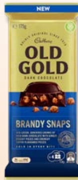
#4269094 Cadbury Old Gold Brandy Block 175g Qty: 16 SKU: 9300617306207