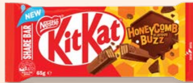
#4268721 Kit Kat Honeycomb Buzz 65g Qty: 24 SKU: 9300605155411