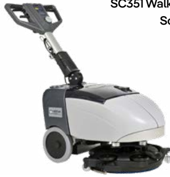
SC351 Walkbehind Scrubber