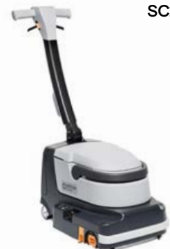
SC250 Compact Scrubber