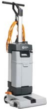
SC100 Upright Scrubber