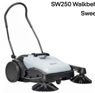
SW250 Walkbehind Sweeper