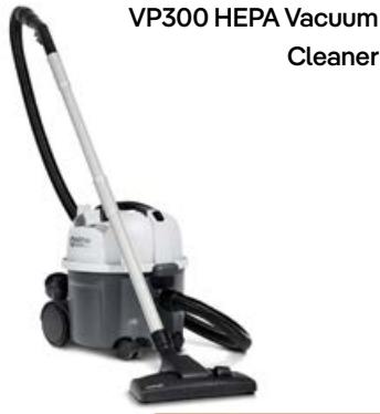
VP300 HEPA Vacuum Cleaner