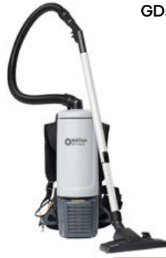
GD5 Backpack Vacuum